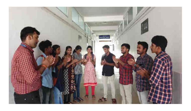
Health Camp - Cancer detection

As usual, Republic Day was celebrated in the campus to express our respect for the Nation. The National flag was hoisted. PO addressed the students about the great Indian culture, history and the core values of our constitution. Patriotic songs, short speeches and shramadhan by NSS volunteers marked the celebration.