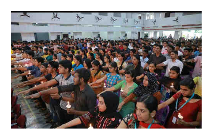
Women Empowerment Program