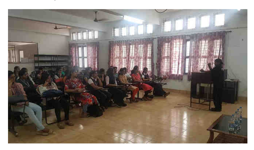
Science Day Celebration

methods of safeguarding themselves from attacks were taught. Women plays multidimensional roles and it is our duty to protect them. The session was really energizing and interesting.